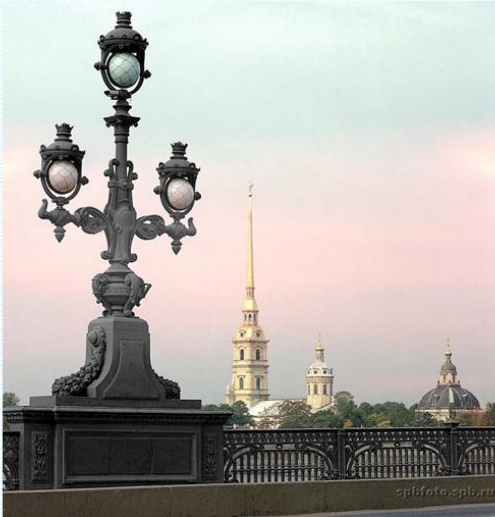
«Peter and Paul Fortress»

St. Petersburg was founded in 1703 by the Russian emperor Peter the Great