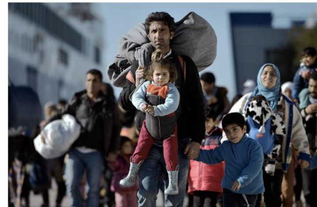
Arriving at Piraeus, Greece, last week. Thousands of others asylum-seekers haven't survived the journey.